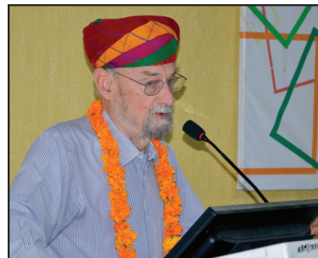
Dr. Ed. Southern Prof. Emeritus, Oxford Univ., U.K.